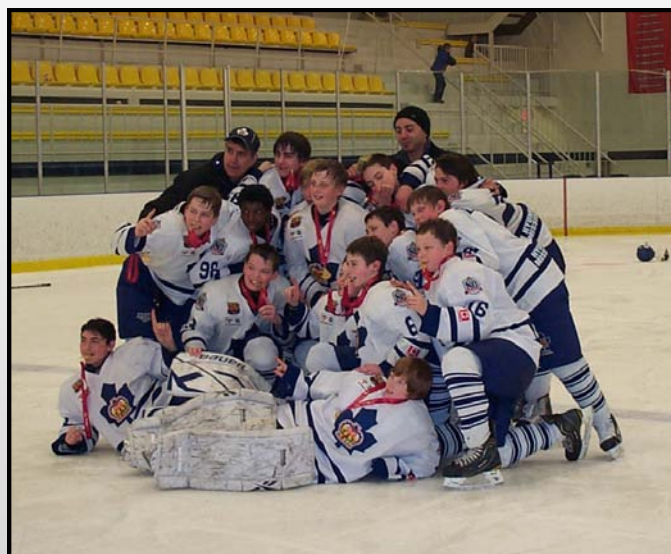
Toronto Marlboros gather on-ice to celebrate their victory

This tournament provides young athletes with competitive opportunities and is an integral component of athlete development in Ontario.