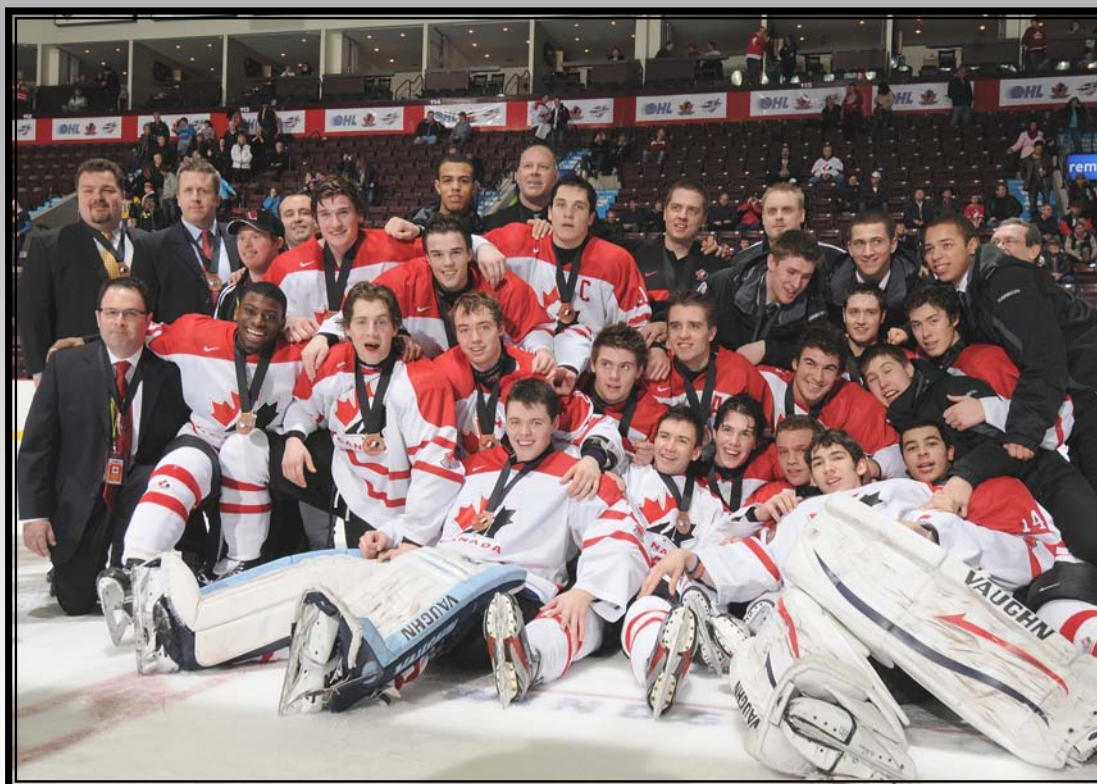
Team Ontario celebrates bronze medal win at WFCU Centre in Windsor, Ontario